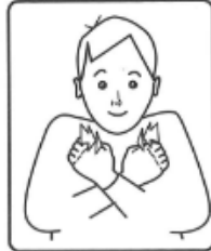
TEDDY BEAR: TEDDY

Closed hands are crossed and hug into chest, contacting twice. Clawed hands may also be used.